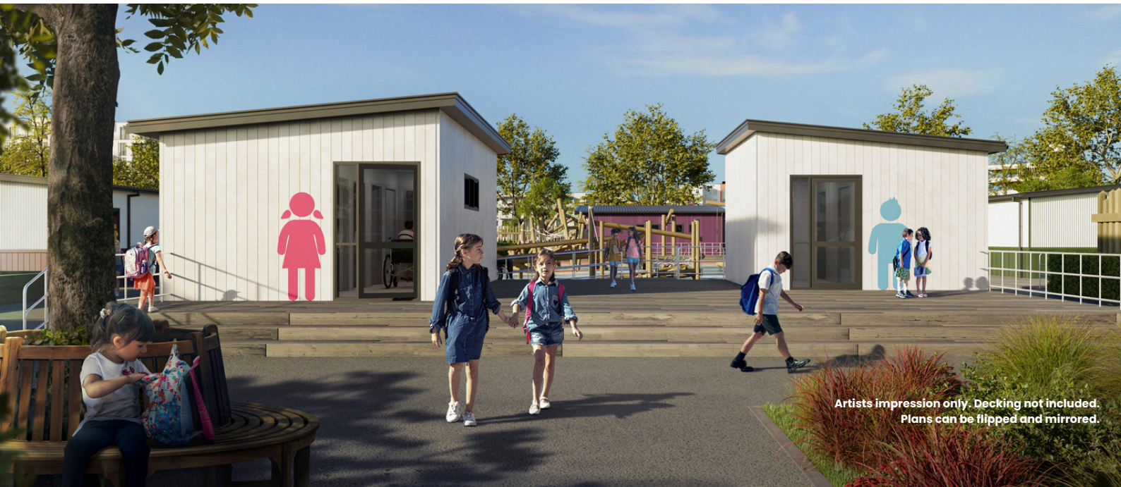
Artists impression only. Decking not included. Plans can be flipped and mirrored.

2 Mono Blocks | 1+1 Cleaner Closets | 4+2 Toilets | 1+1 Accessible Bathrooms | 2 Urinals