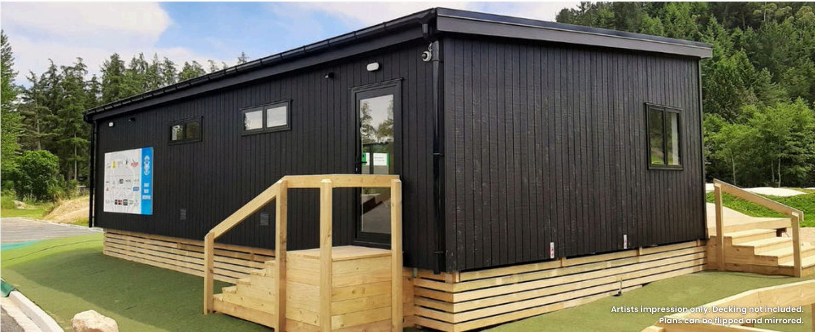
Artists impression only. Decking not included. Plans can be flipped and mirrored.