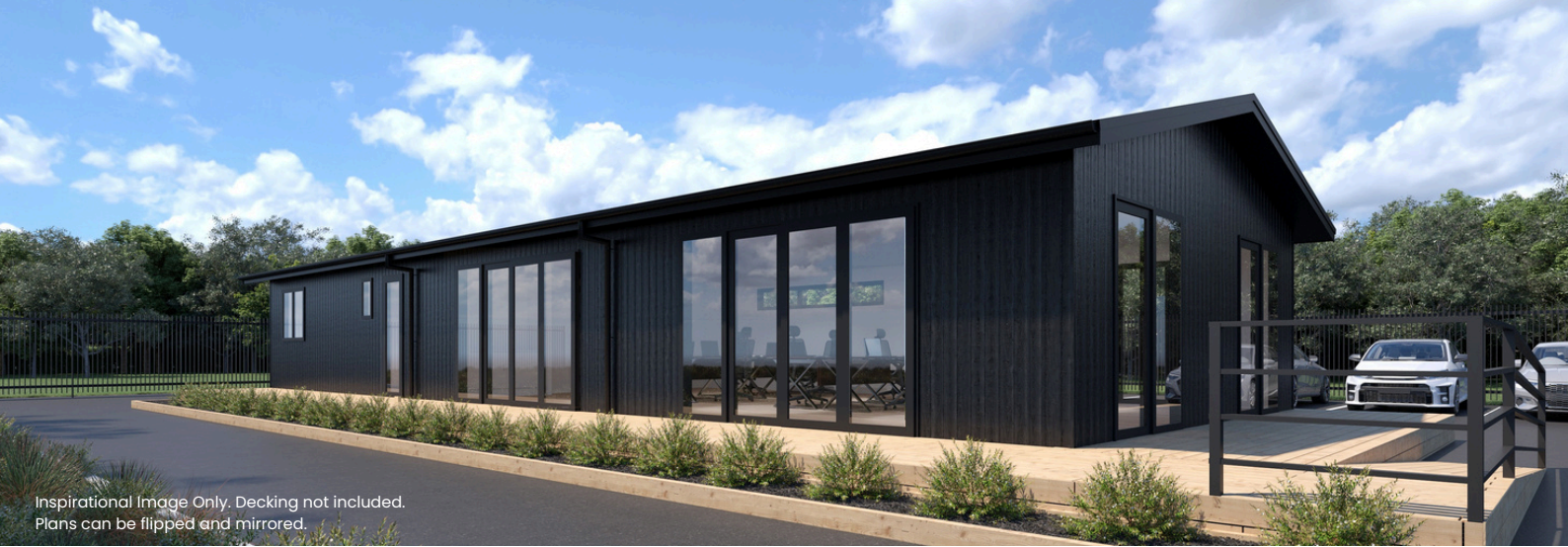
Inspirational Image Only. Decking not included. Plans can be flipped and mirrored.

Gable | 5 Toilets | Large Open Plan Office | 2 Board Rooms | Kitchen/Lunchroom